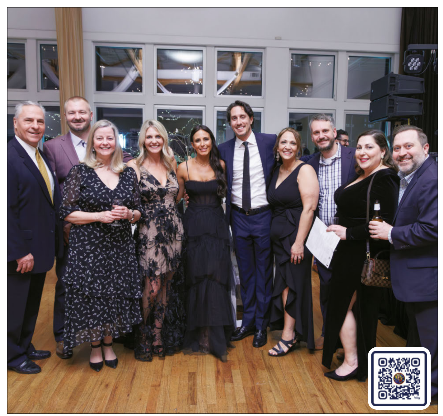
Celebrate 70! OLW Soiree Smiles. Scan the QR code for more photos from this wonderful evening.

434 W. Park Street Arlington Heights, IL 60005 Phone: (847) 253-5353 Website: olwparish.org