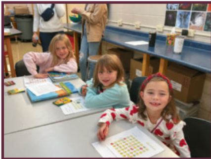
REP Home Study after 9:30 am Mass on Sunday