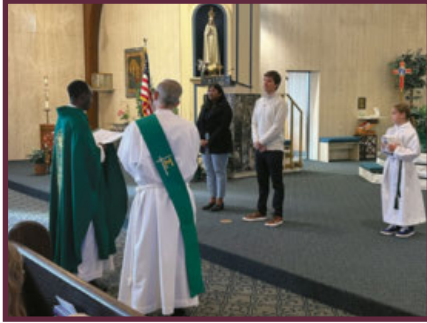
RCIA Rite of Welcoming at 9:30 am Mass on Sunday

Scan the QR codes with your phone's camera to see more pix!