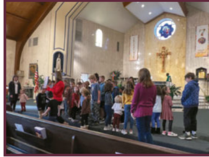
Children's Liturgy at 9:30 am Mass on Sunday