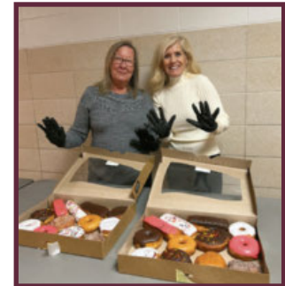
Smiley, black-handed CFM donut slingers