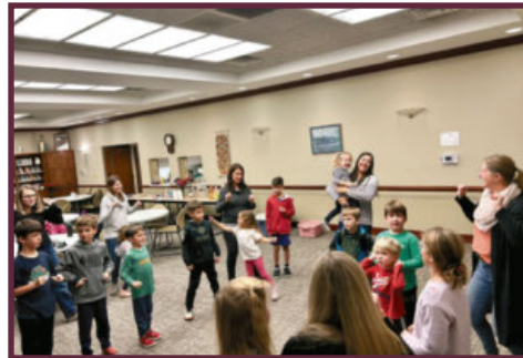
Little Saints "Pie and Praise" Friday, November 10