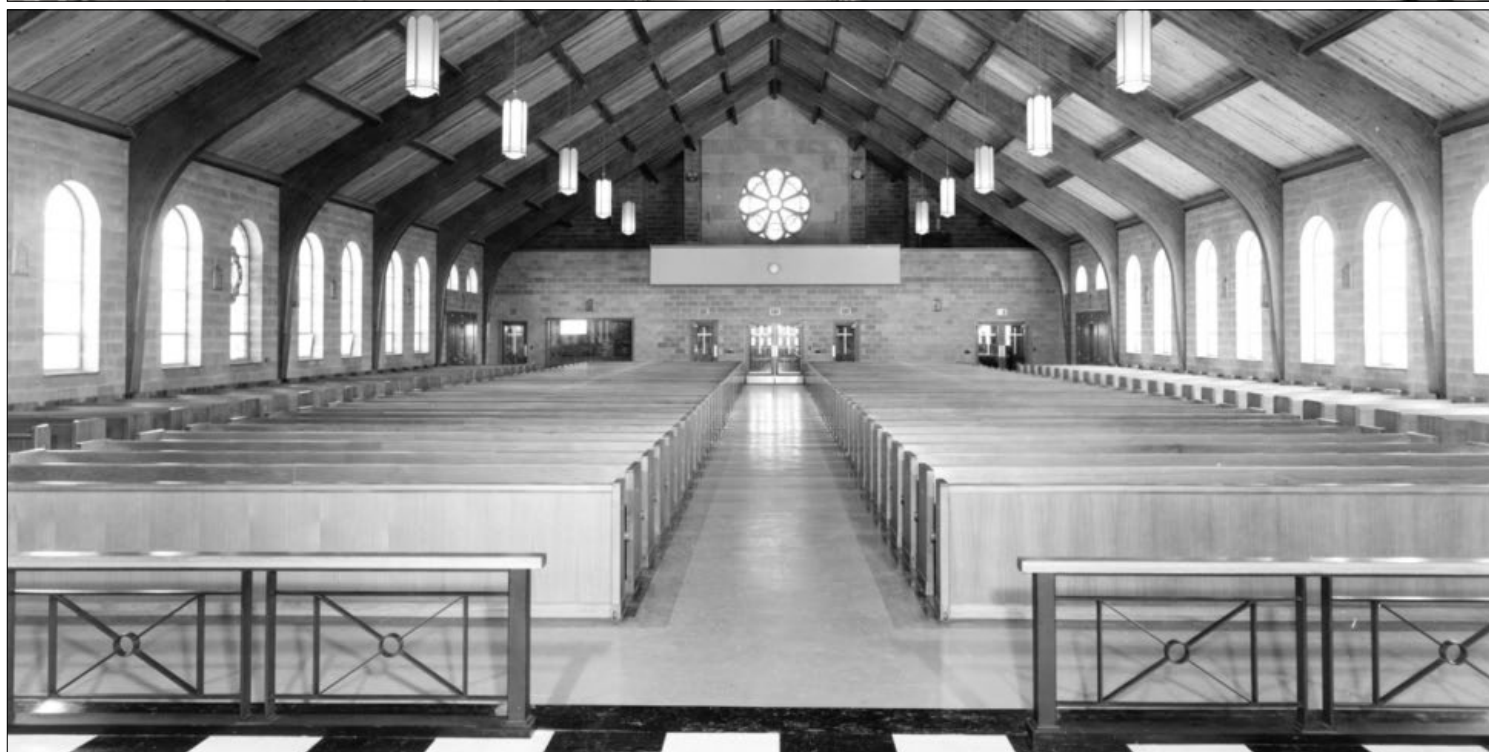
Our Lady of the Wayside Church interior, 1958.

November 19, 2023 Thirty-third Sunday in Ordinary Time