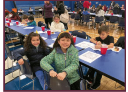
Faith Into Action after 9:30 am Mass on Sunday