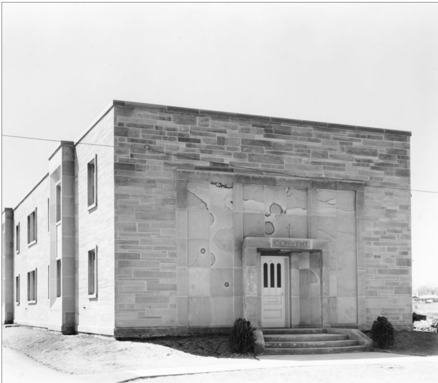
Our Lady of the Wayside Convent, initial phase, 1956

434 W. Park Street Arlington Heights, IL 60005 Phone: (847) 253-5353 Website: olwparish.org