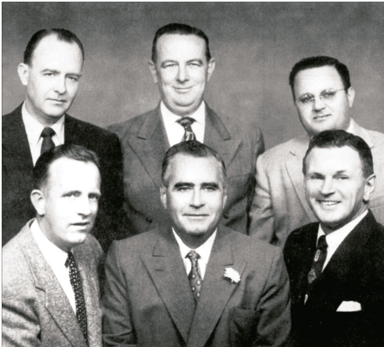
OLW Holy Name Society Charter Officers, 1952-53.

434 W. Park Street Arlington Heights, IL 60005 Phone: (847) 253-5353 Website: olwparish.org