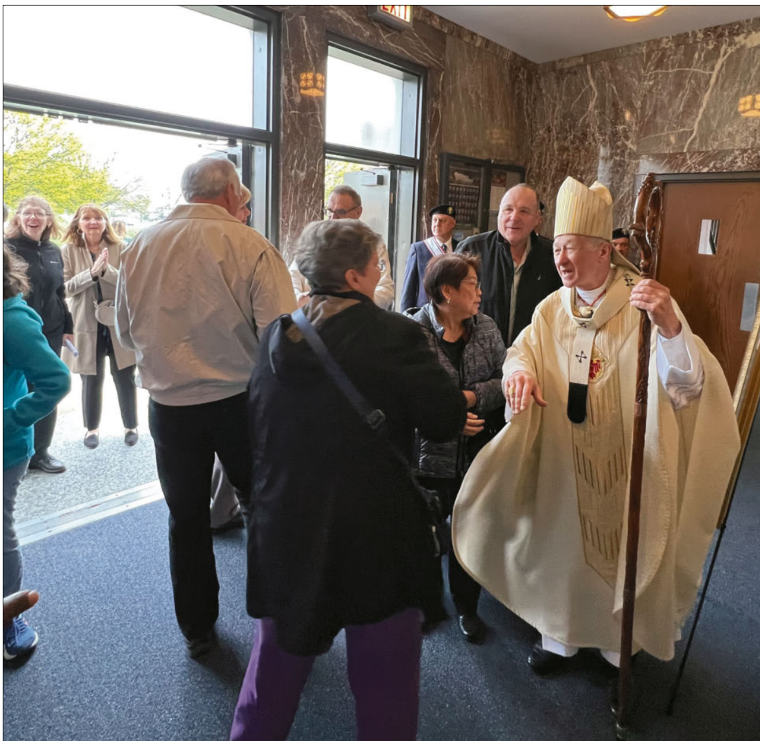
His Eminence shares a smile with a parishioner after Celebrate 70 Family Mass last Sunday.

434 W. Park Street Arlington Heights, IL 60005 Phone: (847) 253-5353 Website: olwparish.org