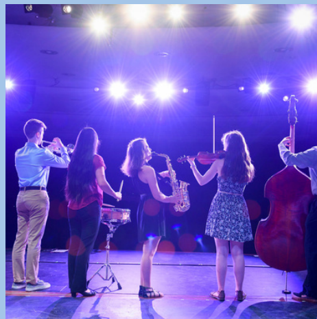
SPECIAL GUEST: PROSPECT HIGH SCHOOL JAZZ BAND COMBO AT DINNER!