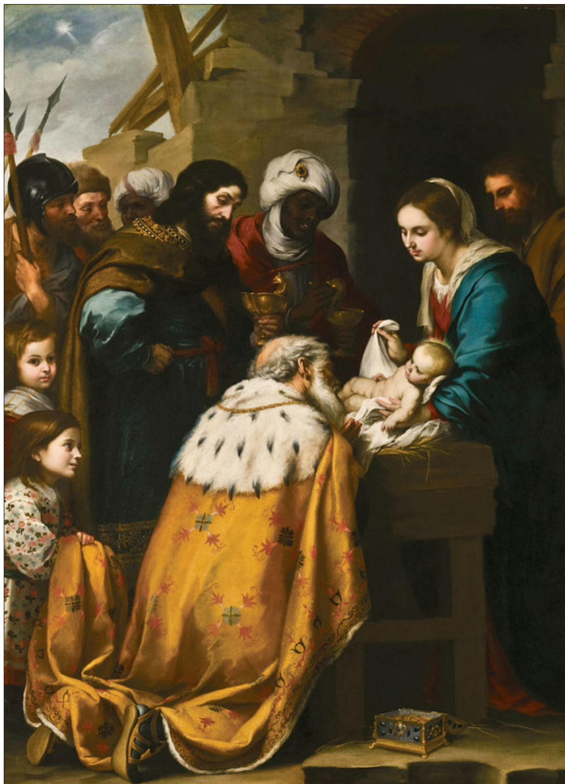
Adoration of the Magi by Bartolomé Esteban Murillo, 17th century