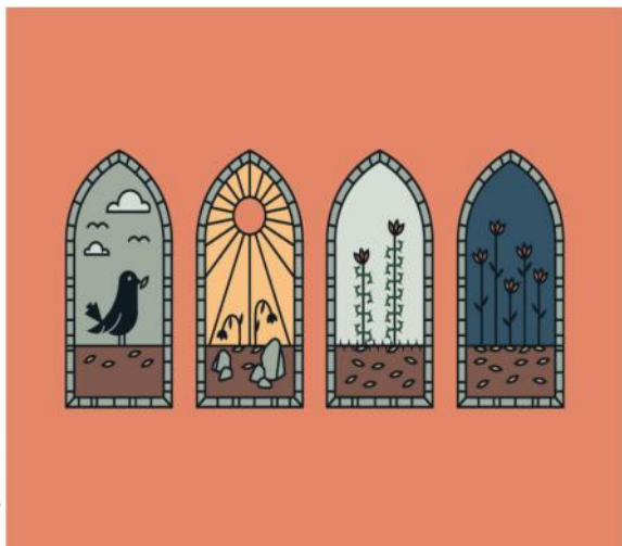
Art by Kailee Koehler

videoconference 9:30–11:30 CDT to discuss next Sunday’s readings